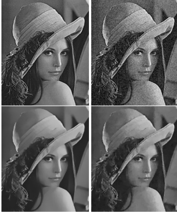
FIG. 1.2. Top: an image, original and noisy. Bottom: the corresponding total variation-regularized image (same \lambda ). Observe that the staircasing is hardly visible on the regularized version of the original image, which is “closer” to BV than the noisy version.

operator -\operatorname{div} \left( \frac{Du}{|Du|} \right) in L^\infty(\Omega) . If f is just bounded, we get only that J_{u(t)} \subseteq J_{u(s)} for any t \geq s > 0 . Other extensions concern the case of several boundary conditions or anisotropic total variation norms. Eventually, we also see how the above results can be extended to convex functionals with linear growth, of the form F(\xi) = \phi(\xi, -1) , \xi \in \mathbb{R}^N , where \phi : \mathbb{R}^{N+1} \rightarrow \mathbb{R} is a smooth and elliptic norm on \mathbb{R}^{N+1} . This includes, in particular, the case where F(\xi) = \sqrt{1 + |\xi|^2} , \xi \in \mathbb{R}^N , which is more carefully analyzed.